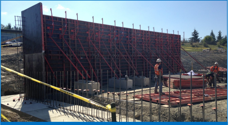
Formwork for east wall of the building