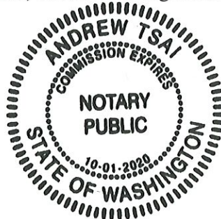
Exhibit 35 SSDP2016-00414 001775