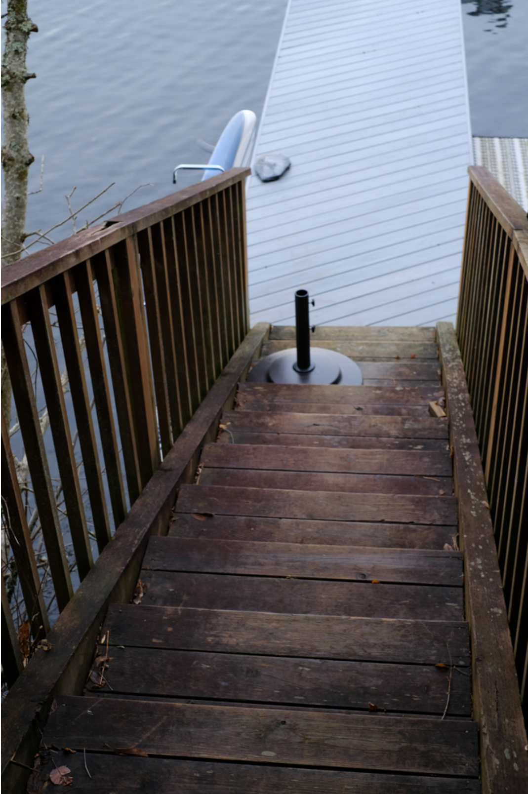
Staircase #39 turns a corner and continues down to dock. Again – all interconnected and elevated from rocky embankment.