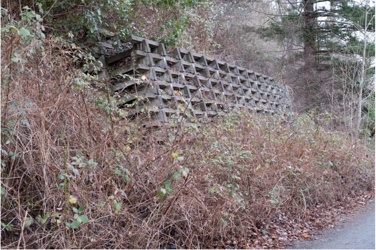
Retaining Wall supporting house and property from collapsing during rains. This must be protected or our property will be at risk from a landslide – which also endangers the trail itself.