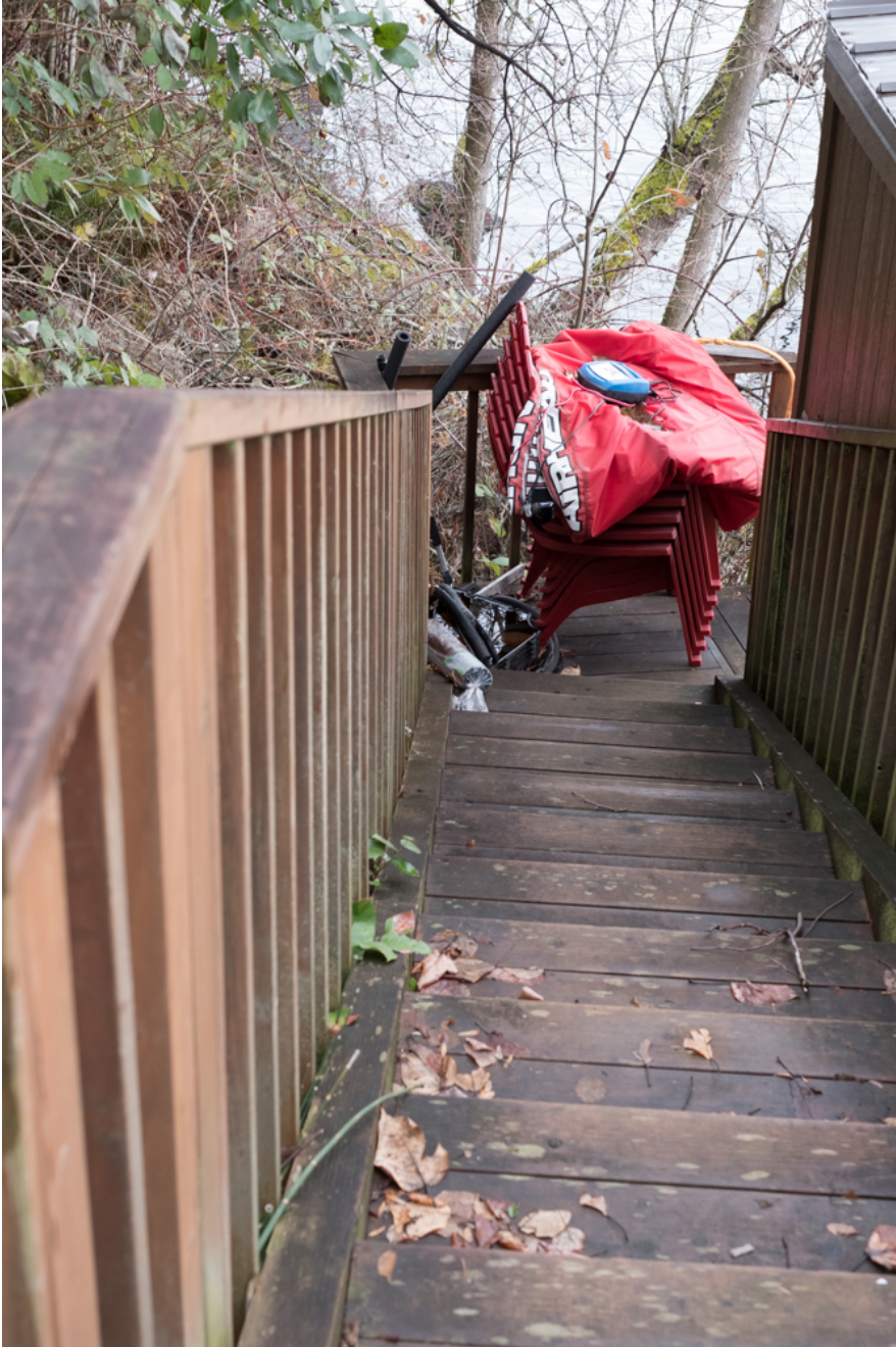
Top part of staircase #39. Elevated system from which a small portion would be impossible to remove safely. The current clear and grub line could be moved about 3 feet in a small area to preserve this.