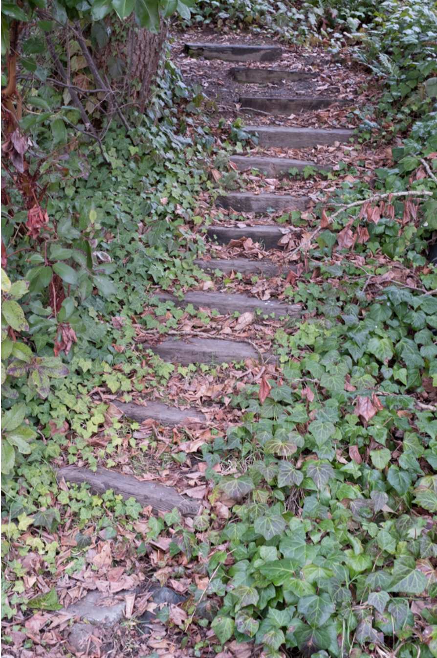
Staircase #40 descending hill. Utilities run along right side of picture. Clear and grubbing could preserve this and preserve our access to our property during construction with a gate in the fence.