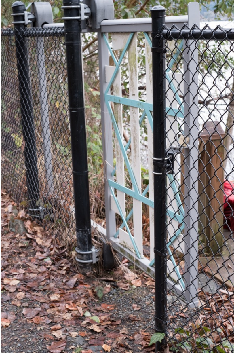
Current gate a fence protecting family and property. Fence also protects trail users from steep slope and rocks. This 'disappears' in the 60% plan.