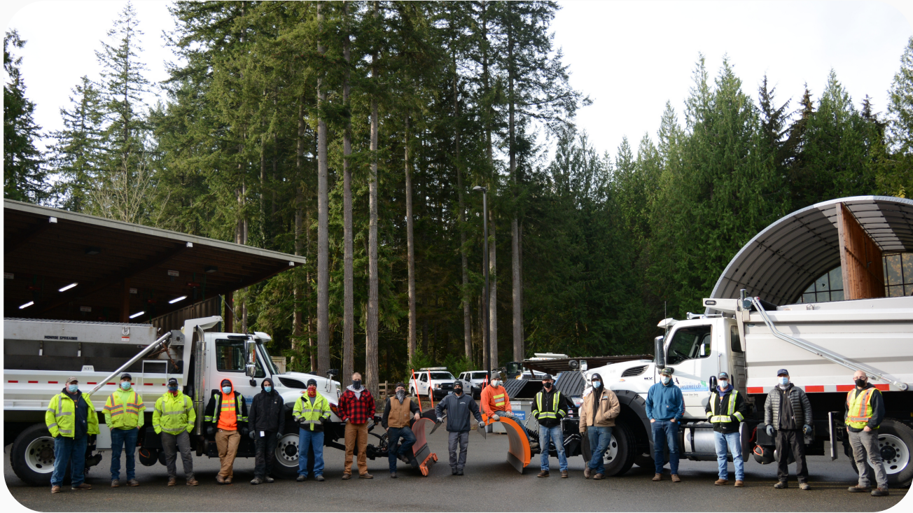
Rain, snow, sleet or ice, this is the team that is working to keep our roadways drivable.

This is the team's first "snow and ice" meeting of the season. Getting trucks, plows and sanders ready for whatever the weather gives us. This year, the team has adjusted to COVID-19 precautions, requiring the crew to work solo or in small teams. They also thoroughly sanitize vehicles at the end of each shift.