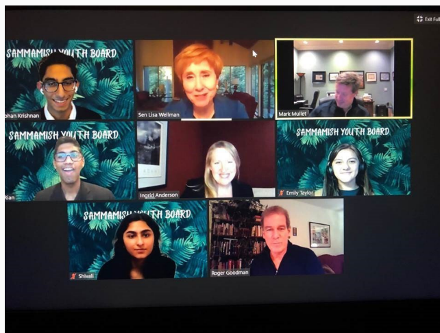
Sammamish Youth Board hosted a virtual town hall with state legislators in October 2020.

To learn more about this formal city program, visit www.sammamish.us and search Sammamish Youth Board .