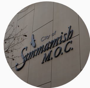
Preparing trucks and plows for winter weather. Thank you to the team for your service to the community.